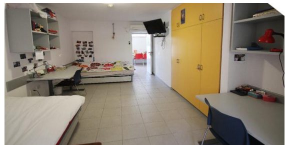
Inside an Einstein dorm room

Prices are 600 USD month for a shared room, utilities and municipal tax included. Students who are living in the dorms are expected to sign a contract and pay in advance. Students who wish to room with a friend may indicate this on their Confirmation Form.